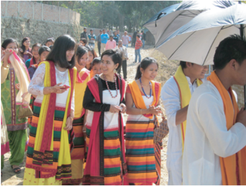
Dimasa girls in traditional Rajampahain Beren with Rihgu and Rikhaosa.

Rih jhamphain: It is a chest wrapper, outer garment worn from chest to knees along with rihgu.