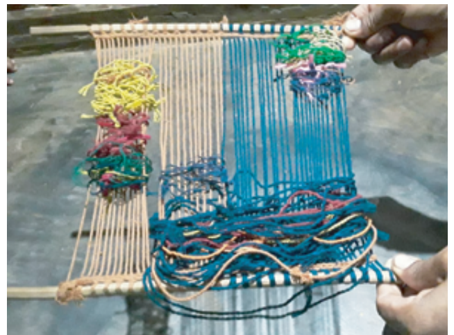
'GONTHAI' © ROOHI