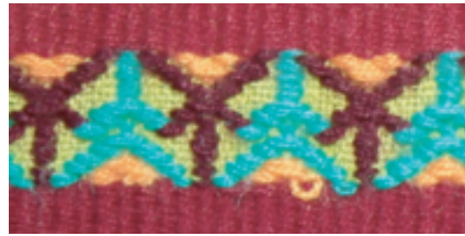
Name of pattern: Nagurlai represents the design of fish scale. © R00HI