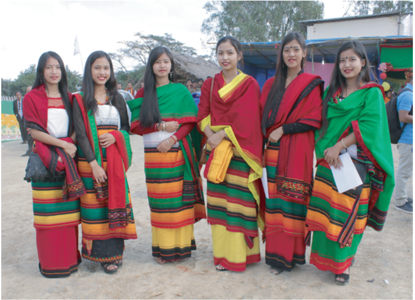
Dimasa girls in their traditional attire 'Rajamphain Beren'