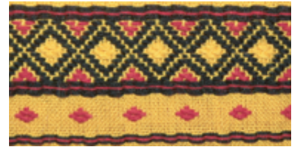
Name of pattern: Baitha meaning paddle/boat oar. © R00HI