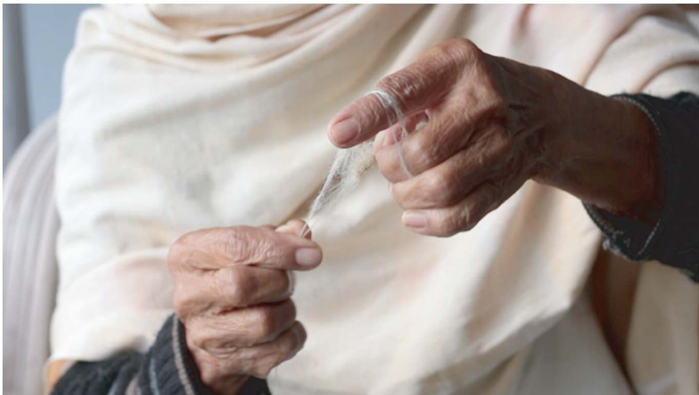
Khunthon meaning eri/endi silk