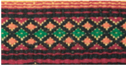
Name of pattern: Bathormai (Parrot's beak with one-line motif) © R00HI