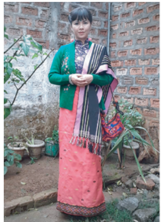
Pink color Rihgu. Pattern 7. Name of Rikhu: Phraphrang jengreng meaning Banyan tree with crab and one-line motif.

Rihgu: It is a wrapper, lower garment worn from the waist till the ankle. This is usually plain but can be woven in motifs. It can be of any colour. It may be smaller or bigger according to the age and size of the wearer. Normally, the size of the rihgu is 'muh bri' (four times the distance between the elbow and tip of the fingers of the hand).