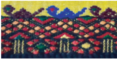
Name of pattern: Sampherma yasong meaning trunk of sampher tree. © R00HI