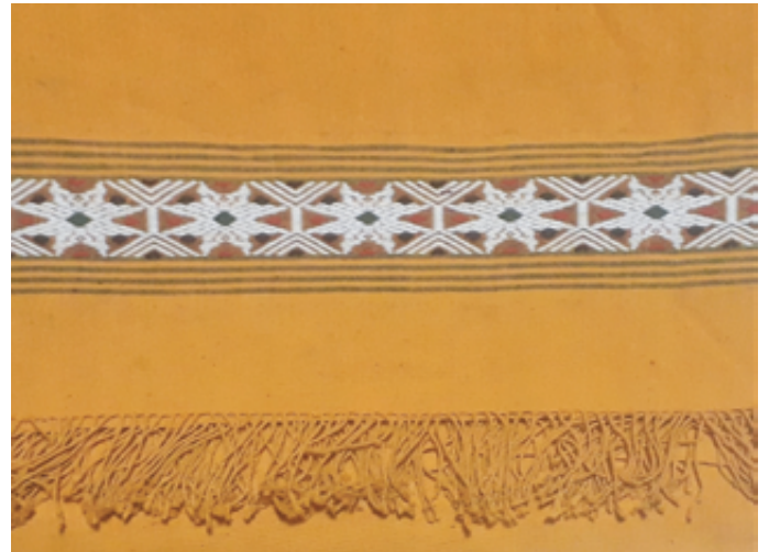
'Rihmsao' - Traditional Dimasa shawl

Hand-woven cotton cloth plays an important role in all the stages of life in a Dimasa community, starting from the birth of a newborn till death.