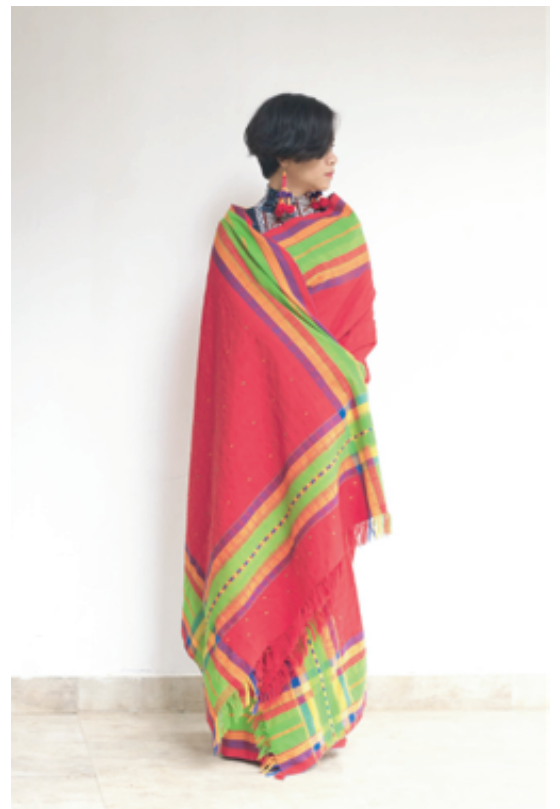
Red Rigu Rikhaosa in Bathormai motif meaning parrot's beak with one-line motif.

Rihgu rikhaosa (rigu set): It is modern wear introduced in the recent past resembling a mekhala chador, a two-piece set adorned and popularised by the Assamese women. It is a semi traditional Dimasa wear consisting of two pieces.