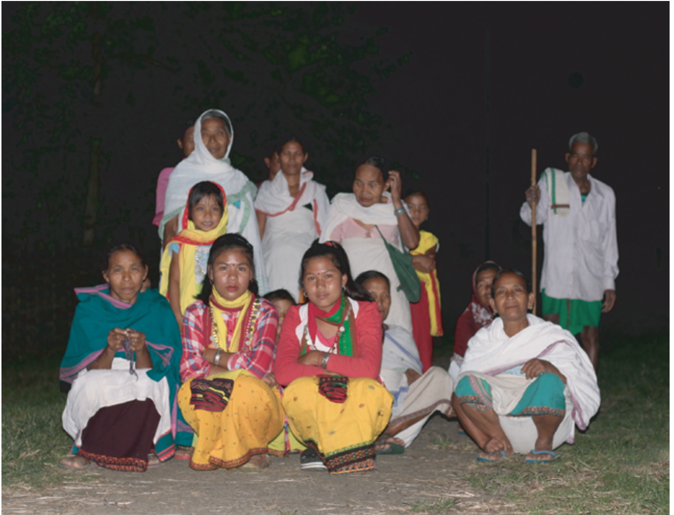
Dimasas of Samparidisa village in Dima Hasao district of Assam.

The Dimasas are one of the earliest aboriginal tribes of India. Dimasas consider themselves to be the descendants of the Brahmaputra river. The word 'Dimasa' is taken from three words of Dimasa dialect 'di' 'ma' and 'sa', which means 'water', 'big/ great' and 'son' respectively. So the literal meaning is, "the son or descendant of a big river". Dimasa ethnic group is one of the Scheduled Tribes of India and belong to the Indo-Mongoloid group of people. Dimasas now mostly inhabit the Dima Hasao district in the state of Assam in India. Dima Hasao is one of the two hill districts of Assam enjoying the status of Autonomous District under the provision of the Sixth Schedule to the Constitution of India.