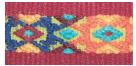
Name of pattern: Gadha ni turisamin bathai meaning old fruit pattern from a bamboo shuttle. © R00HI

Rihgu: It is a wrapper, lower garment worn from the waist till the ankle. This is usually plain but can be woven in motifs. It can be of any colour. It may be smaller or bigger according to the age and size of the wearer. Normally, the size of the rihgu is 'muh bri' (four times the distance between the elbow and tip of the fingers of the hand).