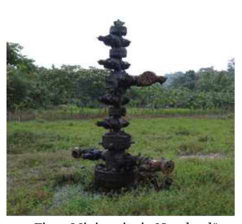
Fig 2: Mining site in Nagaland*

The justification for the ongoing coal mining activities rests on Article 371 (A) of the Indian constitution. This provision guarantees special rights and protection for Nagas living in Nagaland. All Naga people in the state have the right over natural resources and ownership over land. In addition, all matters pertaining to customary law, religion, and social