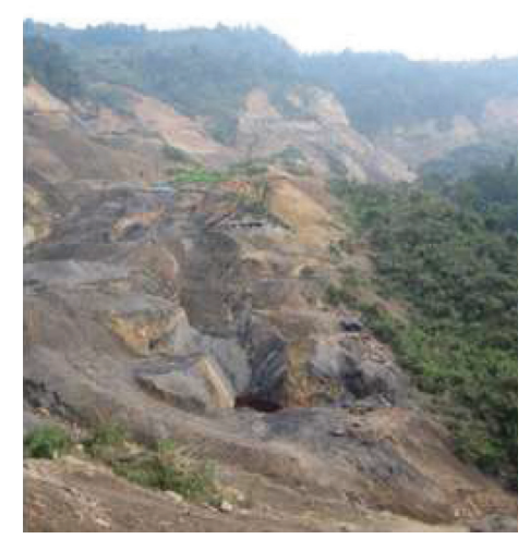
Fig 4: Mining site in Nagaland*

Mv ongoing research engagement in Northeast India dwells on the political economy of extraction. Therefore, the questions I have posed above comes from my long drawn engagement with multiple political actors on the ground in the extractive landscape across the region. Focusing on coal mining villages, hydrocarbon politics Assam. and in paving attention to the ongoing mining debates in Meghalaya, Tripura, and Arunachal Pradesh including Manipur, the context of Nagaland needs to be understood in relation to its neighbouring states. Particularly, an important form of politics around