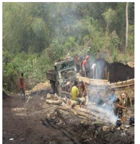
Fig 3: Mining site in Nagaland*

practices. At the centre of this constitutional provision is the confusion and the overlapping power systems between the state authority and the tribal councils across the state.