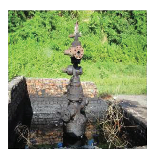
Fig 1: Mining site in Nagaland*

I will be sharing my reflections on the ongoing coal mining activities in Nagaland and highlight the aspirations for a carbon future among powerful